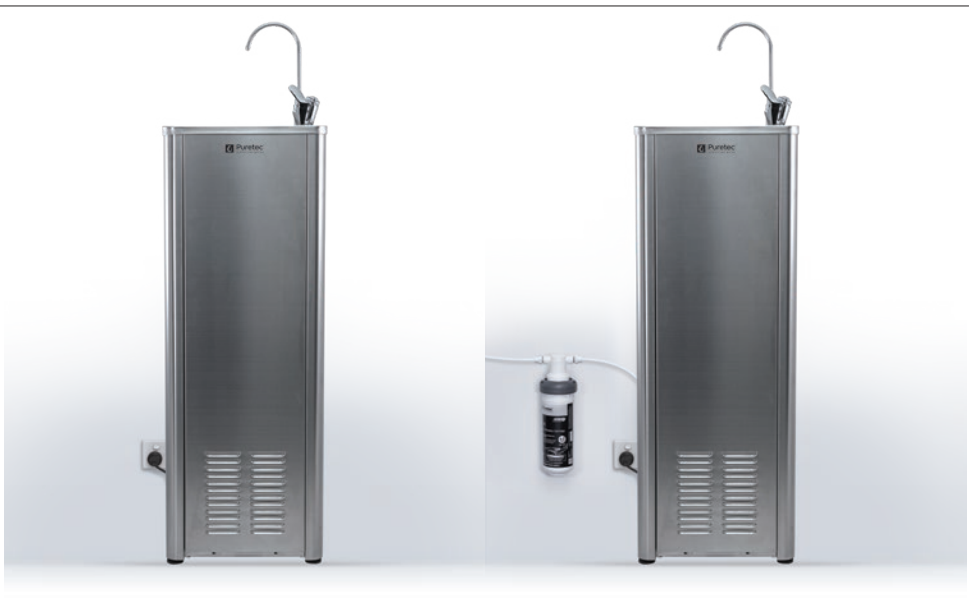
Filter Cartridge Installed Internally